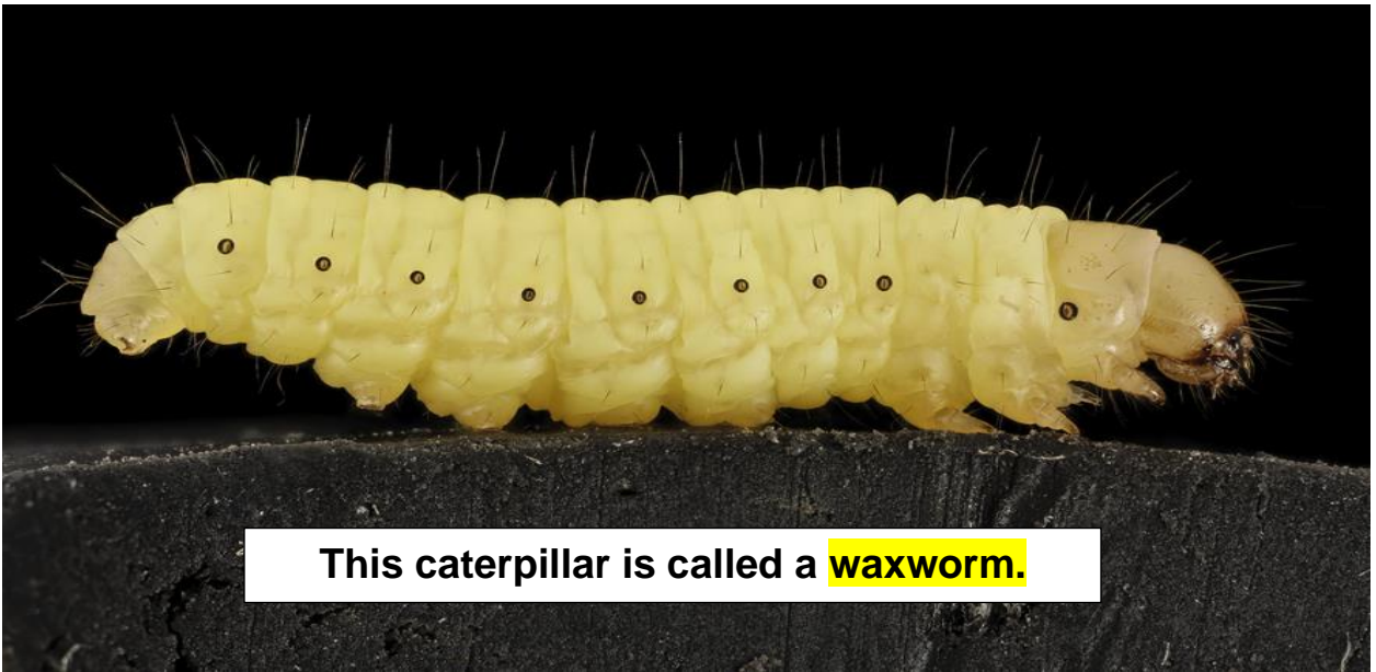
This caterpillar is called a waxworm .